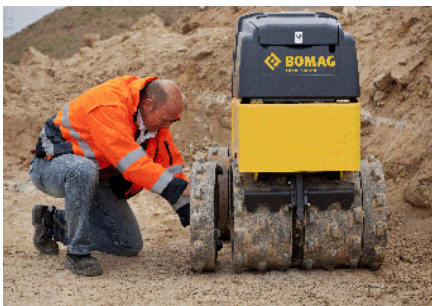
Flexible working widths Original BOMAG drum extensions