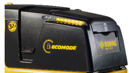
Higher quality, lower costs ECONOMIZER - The compaction display (optional)