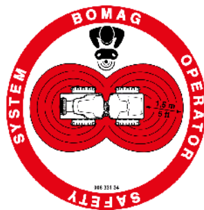
Safe operation Radio/cable remote control with integrated operator protection